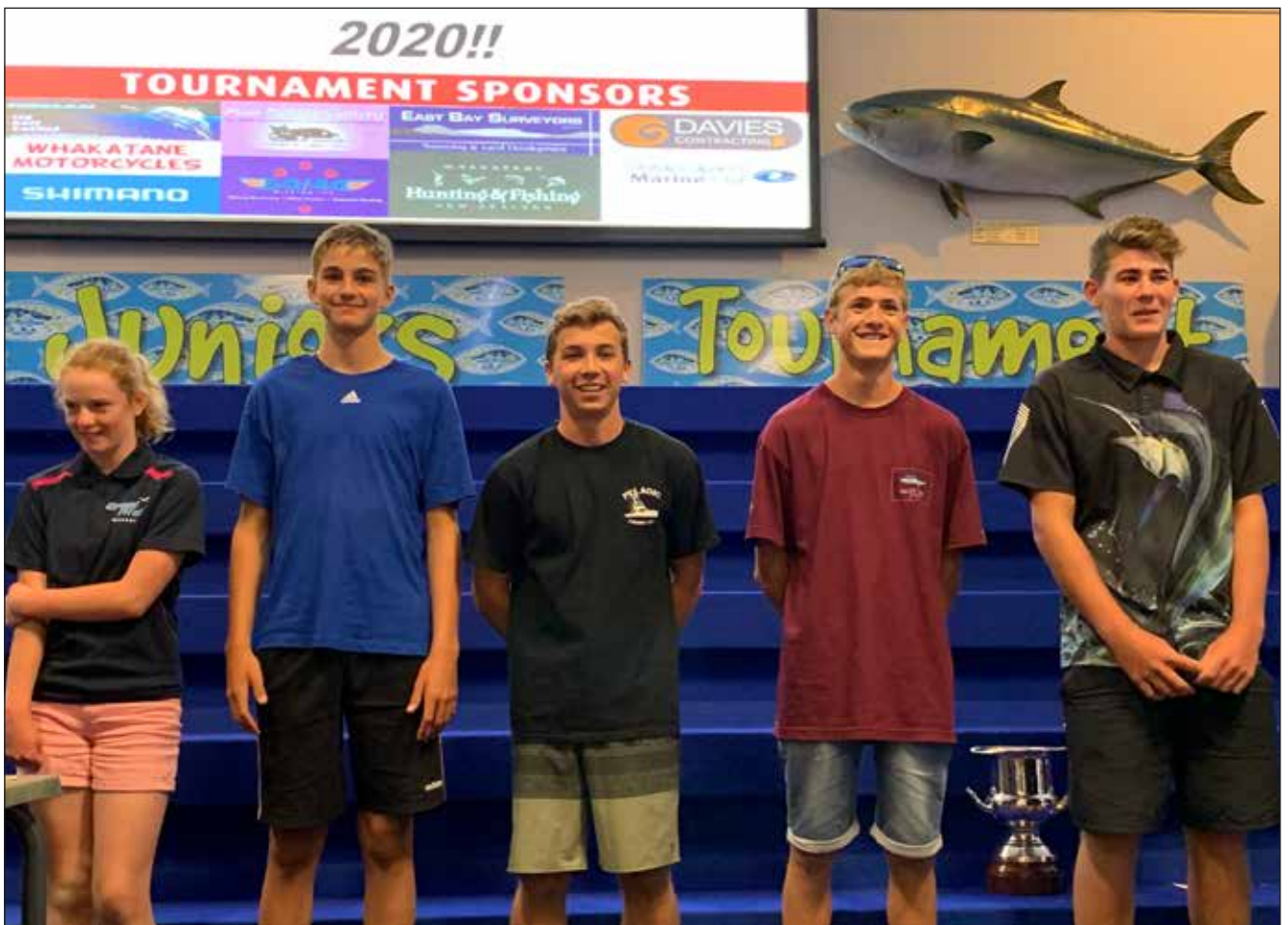
Our Wonderful Junior team to represent our club at the Bay of Islands. Trip was unfortunately cancelled due to the COVID lockdown