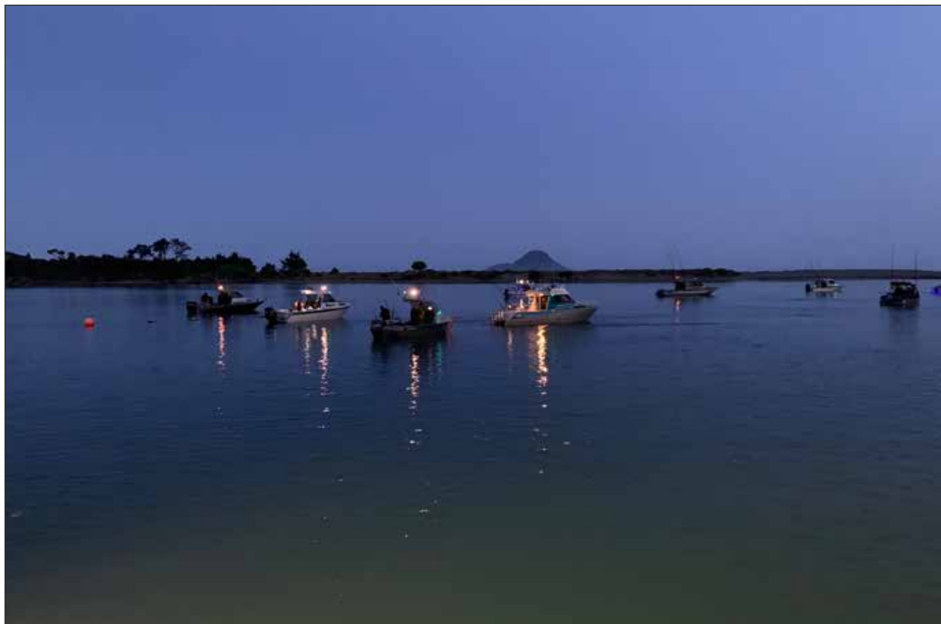
OneBase 2020 Kick off!