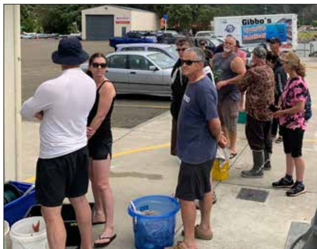
Hams weigh in