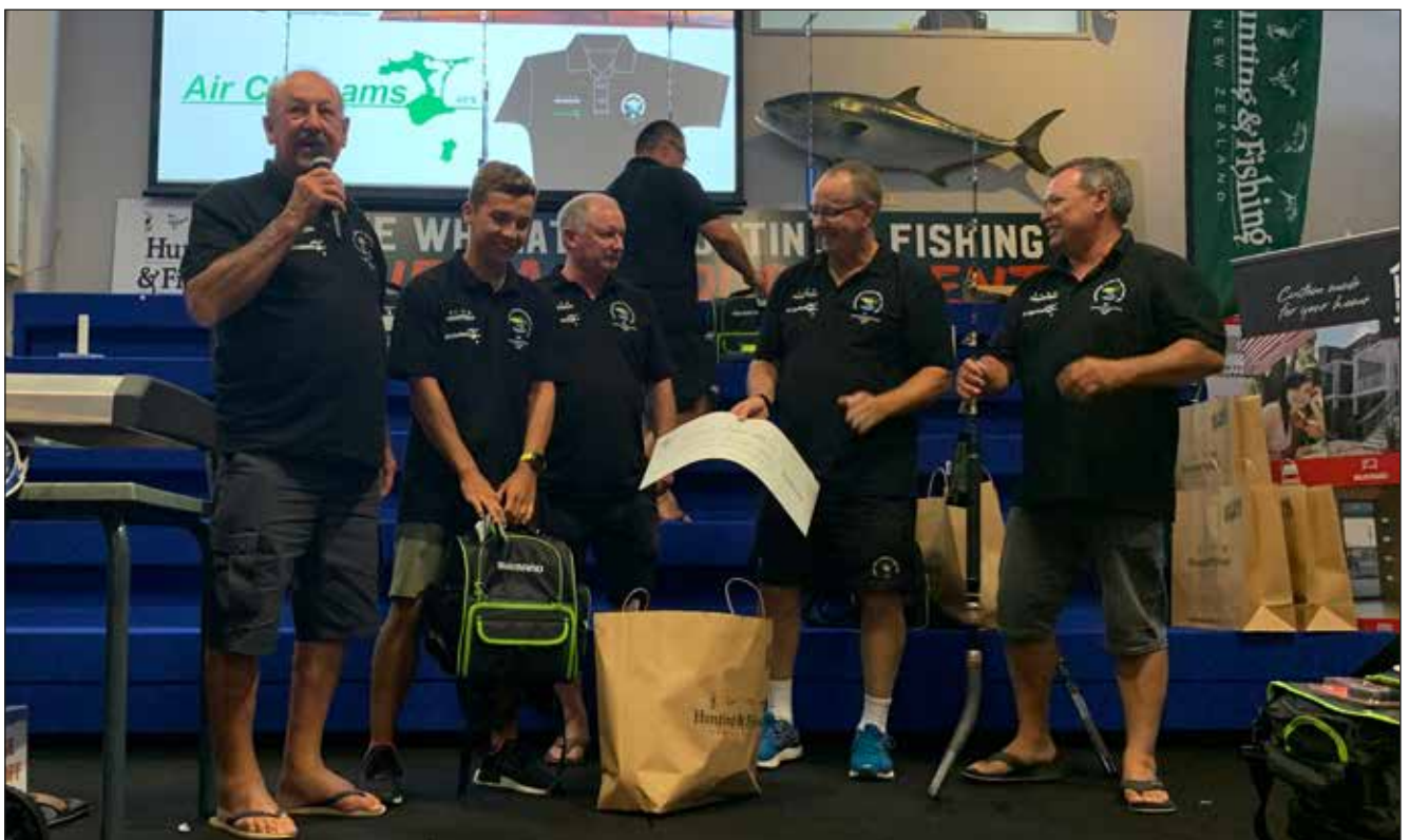
Team Annjakana. Winning team Heaviest Marlin